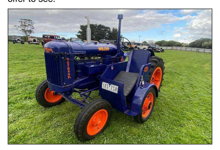
Whilst usually perched in the actual driver's seat of a tractor, this time I was given the change of riding in a tractor side car seat. Many of us took up the