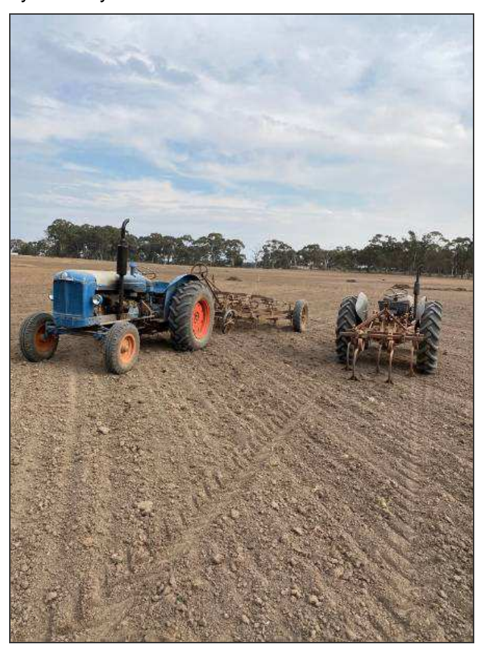
Ready to plant

into piles and burnt. Rocks collected and removed by hand by members.