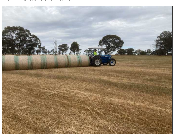
Lining up the bales

A contractor bailed it up after club members mowed the oats and formed them up into rows. Good going from 70 acres of land!