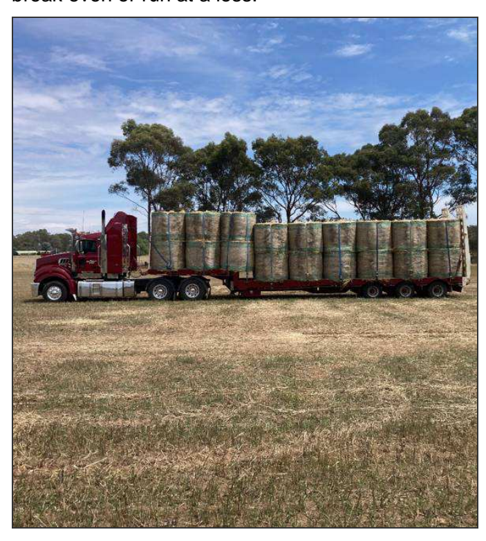
The load is ready to go

farming can come and learn just how hard the work on the land is and the worry you have if you will break even or run at a loss.