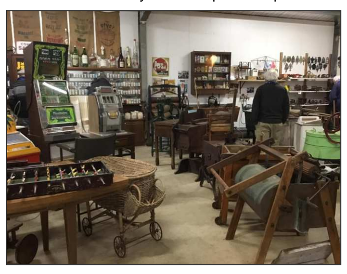
The photos above and below are only a small sample of what was on offer to see.

I won't talk about all of them but just the two that were on the top of my list, and I would defy anyone to go to either of these collections and not find something of interest. The first was an amazing collection of absolutely everything you can imagine. The stunning thing was that they did not just have one of each item they had multiple examples.