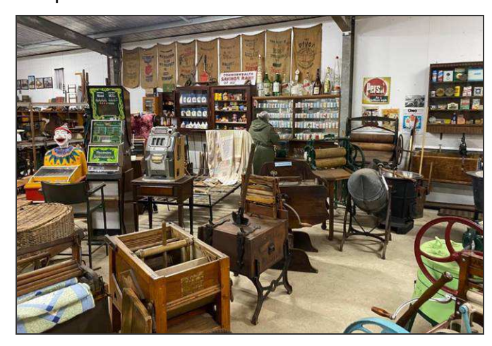
The second collection (below), for me, was exciting due to the number and variety of machinery on offer to see.