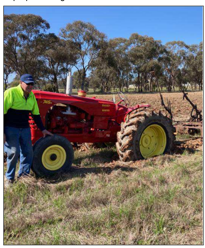
Bit damp for ploughing

It all started with a thought that CVRG members can do this. Land was found at the Echuca end of Huntly. New gateway was installed. Some historic farming equipment was purchased, fixed and used to prepare the ground.